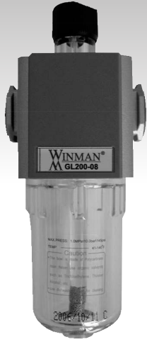
Sembol / Symbol